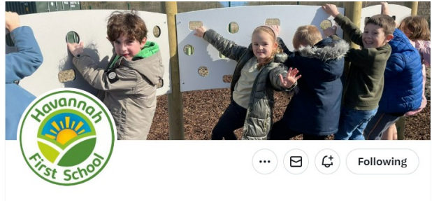
Havannah First School @Havannah1st Follows you

We are always available to talk to you briefly at drop off and pick up times. If you need more time to discuss something, you can contact us via telephone or arrange a time to meet. As far as we can, we have an 'open door' policy and you will always be welcome to come and talk to us. No question is too small! We have a well used Twitter account @Havannah1st and we use